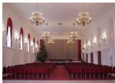
The Royal Castle Gödöllő (Grassalkovich – castle)