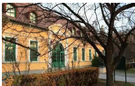
F. Chopin Elementary Music School

F. Chopin Elementary Music School, only one Hungarian music school named after Chopin, Gödöllő Symphonic Orchestra, Gödöllő Royal Castle.