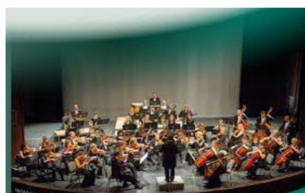
Gödöllő Symphonic Orchestra

The VII International Chopin Piano Competition will be held in Gödöllő, a small town close to Budapest, having sights of historical importance,